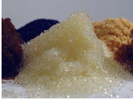
Ion Exchange Resins

Immediately the cation resin bead then gives up one of its Hydrogen ( H^+ ) ions. This is the basis for “ion exchange”. You give up one ion for another.